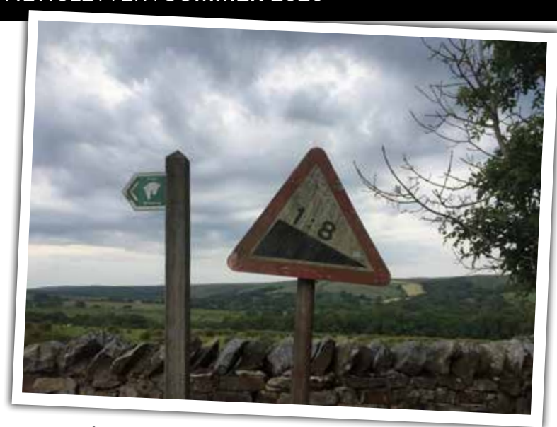
Everything is a series of ups and downs.

I have developed a new obsession. Dock. (Rumex obtusifolius if we're going all posh.) My field has always had a few patches of dock leaves that I have managed in various ways. I'm probably over cautious but I don't like the idea of weed killers with free ranging chickens and geese, not to mention the ponies. So, over the years I have