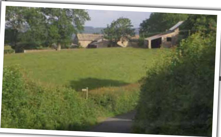
Remote bridleways waiting to be explored

Another summer and another wildly unpredictable array of weather conditions. It is a good job we're a durable lot isn't it? The contrasts between one day and the next (and sometimes morning and afternoon) are enough to make you loopy. Sun block or thermals? Gloves or sunglasses? Ho hum - I guess we'll never get bored or complacent.