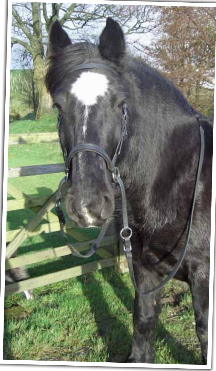
A woolly William