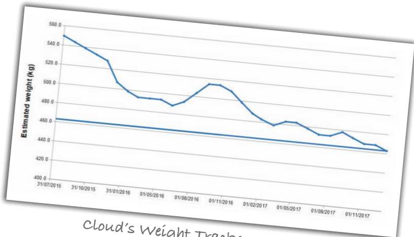
Cloud's Weight Tracker.

Three years ago I read an article about laminitis, in which a researcher was appealing for volunteers to measure and record the weight, general health and feeding regime of their horse/pony. At the time my 13.2hh fell pony, Cloud, was extremely fat and weighed approximately 550kg. I had been trying almost since the day I bought him to keep his weight under control, but by that summer he was fatter than ever and so this seemed like a good opportunity to try to do something about it.