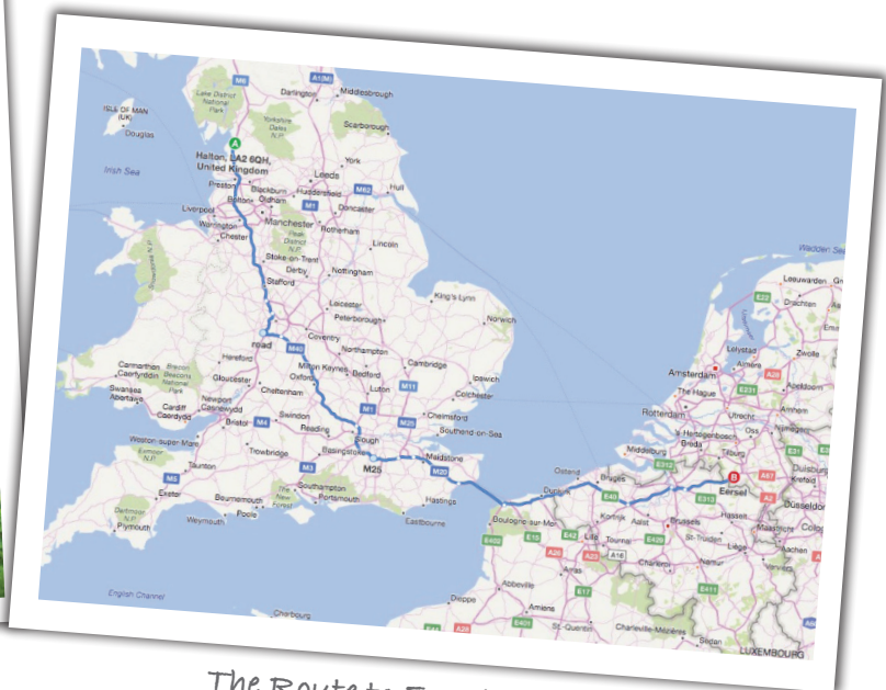
The Route to Eersel.